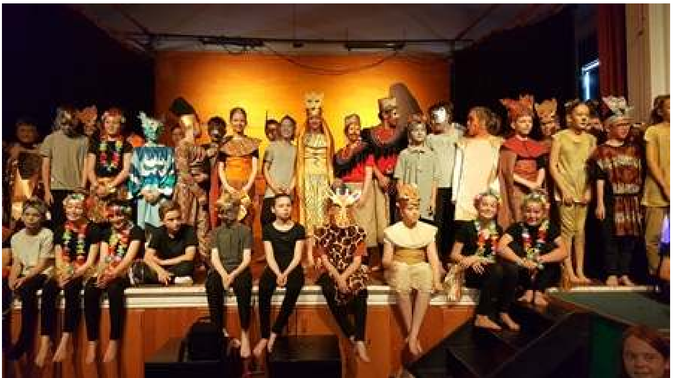
The cast of the Lion King.